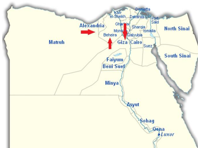
Fig. 1. Map of Egypt with arrows indicating the three governorates in which samples were taken.

Some nematode specimens were processed in 5% formaldehyde solution followed by anhydrous glycerin (Seinhorst, 1959) and examined under a compound microscope for species identification by morphological analysis using taxonomic keys (Geraert, 2008; Golden, 1986; Handoo, 2000; Handoo & Golden, 1989; Handoo et al. , 2007; Hunt & Handoo, 2009; Raski, 1991; Robinson et al. , 1997; Sher, 1966). Frequency of occurrence ( [\text{number of positive samples} / \text{number of total samples}] \times 100 ) and nematode density (nematodes per 250 cm 3 soil sample) were determined for the identified nematodes in composite samples and recorded.